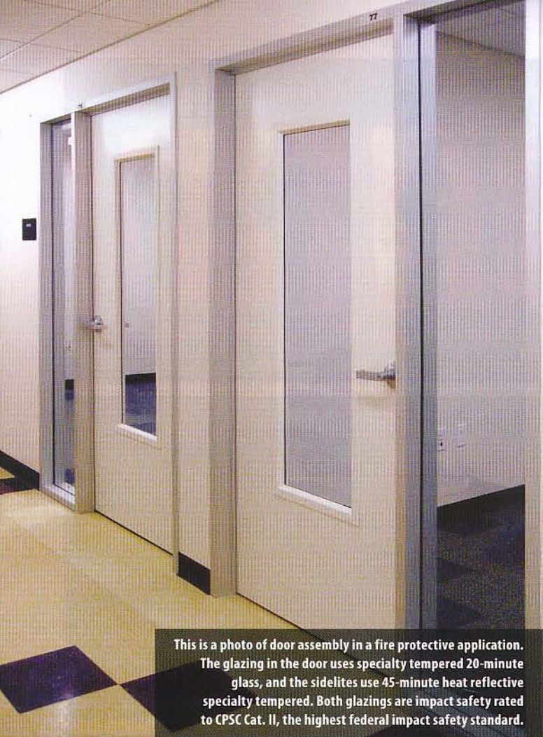
This is a photo of door assembly in a fire protective application. The glazing in the door uses specialty tempered 20-minute glass, and the sidelites use 45-minute heat reflective specialty tempered. Both glazings are impact safety rated to CPSC Cat. II, the highest federal impact safety standard.

what is currently required for hardware preparation, is gaining interest and support. The Window and Door Manufacturers Association (WDMA) has submitted a NFPA code change proposal that would require glass to be "installed in accordance with the manufacturer's inspection service procedure and under label service."