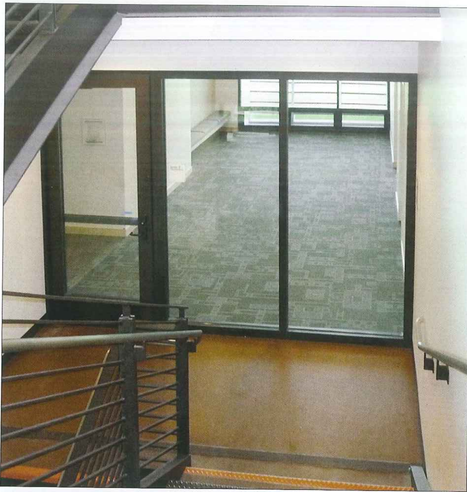
A two-hour exit enclosure with 90-minute doors. Fire-resistant glass is used to bring vision and transparency to the two-hour exit enclosure/stairwell.

The study found that, “in over half of non-residential properties and in 60 percent of residential properties, the fire spread was limited to the room of fire origin. Depending on the building use, this proportion rises to over 85 percent—87 percent in educational properties and 90 percent in health-care related properties. In other words, without benefit of additional active systems, the combination of pre-2003 building construction, design, fire load, and fire department response results in fire containment in well over half of the properties in the dataset. While PFP [passive fire protection] is not alone responsible for this containment, it is a critical component of an overall fire protection system, beginning with the