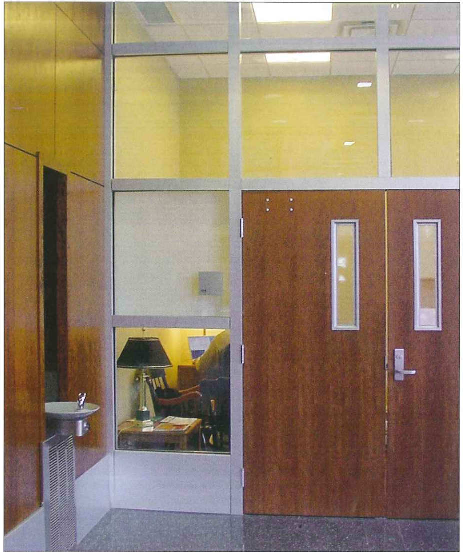
A two-hour wall with 90-minute doors. Specialty fire protective glass can be used in 90-minute vision panels up to 100 square inches.

As of this writing, the various players are still huddling, but their task is hardly insurmountable. Intertek Testing Services (ITS) currently certifies two installation programs addressing the field modification of existing fire-rated products which can serve as examples. Garrett Tom of Product Certification Consultants administers a training program covering hardware issues. SaftiFirst administers a training program addressing the field filming of glass. In each case, ITS reviewed the proposed educational information and its format to ensure comprehensive coverage of the installation methodology and related code requirements, established a reasonable certification renewal and annual fee schedule, and prescribed labeling protocol. Program participants are obviously required to pass a certification examination after completing the training and must be prepared to present their personalized certification card at the request of any authority having jurisdiction (AHJ) while on the job.