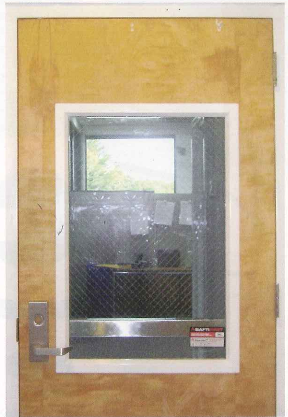
Safety wired glass such as SuperLite I-W can be used in doors, sidelites and other hazardous locations because it meets CPSC impact safety requirements. Traditional wired glass (non-safety) cannot meet this impact standard and can no longer be used in these locations throughout the majority of the United States.

construction and in all types of occupancies. Replacement glazing up to 9 square feet (1,296 square inches) also had to meet the minimum CPSC Category I requirements. Furthermore, all glazing in gymnasiums or athletic facilities had to meet the more stringent Category II requirement.