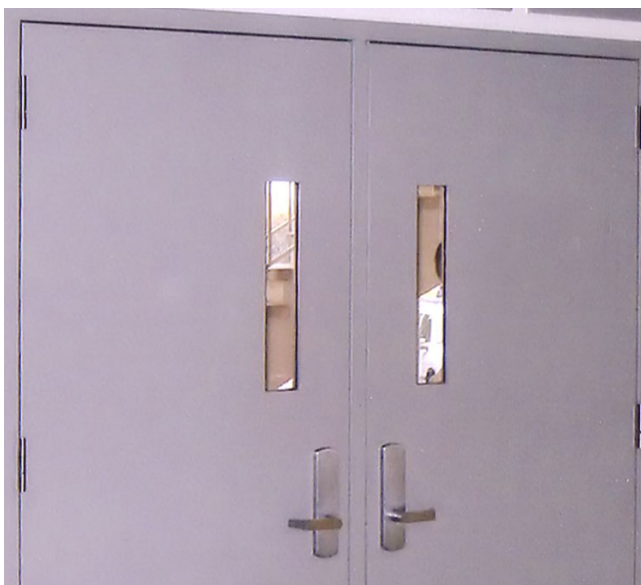
SuperLite X-90 in HMTR door

SuperLite X-90 is listed and labeled by Intertek/Warnock-Hersey Inc., a nationally recognized testing laboratory approved by OSHA.